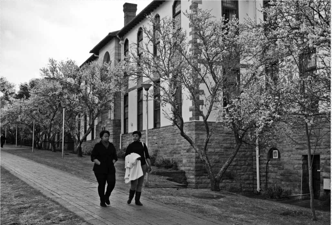
Two Rhodes students walking through campus